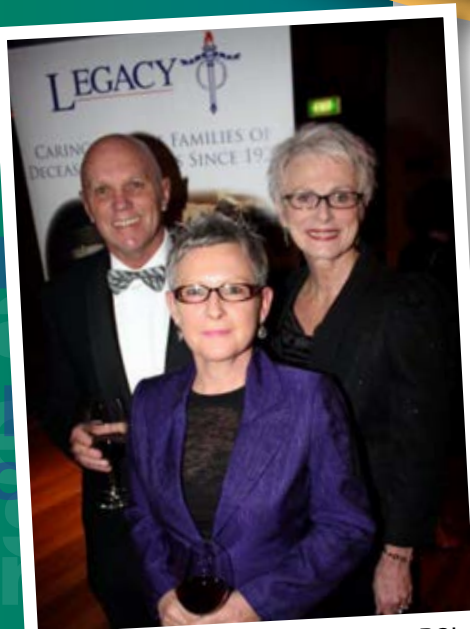
BSS is working with Legacy, the RSL and the Army to commemorate Remembrance Day 11/11/11 in a very special way. The school supported Legacy's annual fundraising dinner.