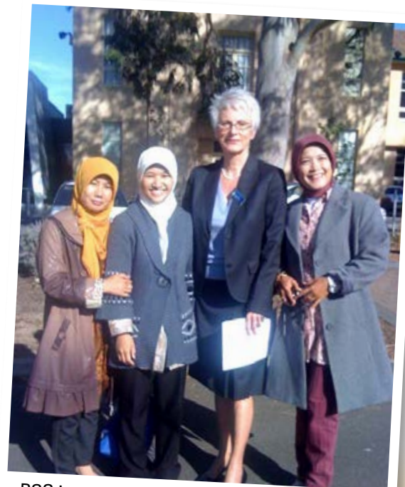
BSS is one of 3 schools selected to provide a training program for visiting Indonesian teachers.