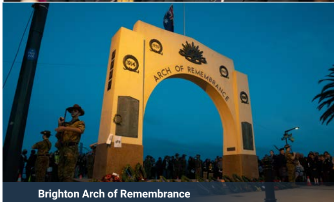
Brighton Arch of Remembrance